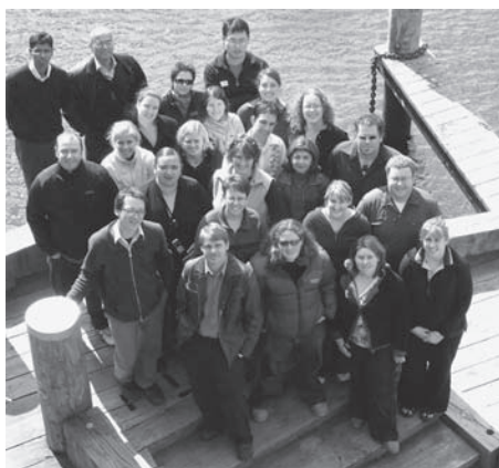
PPTA's young and new teachers' network meets in Wellington.

Consultation with principals is currently being undertaken to determine what items they wish to see in their claim. Regrettably, proposals from SPANZ (Secondary Principals' Association of New Zealand) to form its own union have complicated this process. The creation of a second secondary principals' union, if it eventuates, will inevitably weaken the influence of secondary principals and result in declining conditions for both principals and teachers.