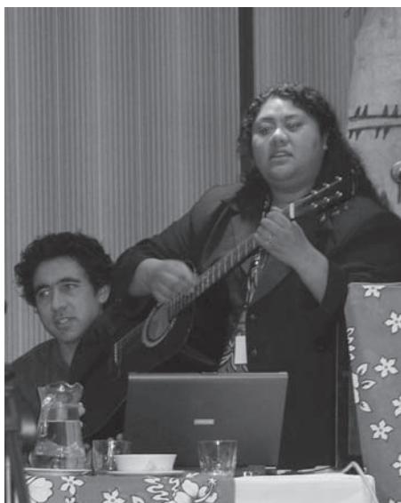
Komiti Pasifika held a very successful conference "Voyaging the Future" in July 2006.

groups. These include New Zealand Qualifications Authority, Education Review Office, Secondary Futures, Parent Teacher Association, the Association of Proprietors of Integrated Schools, the Rural Education Reference Group, subject associations, the Teachers Council, The Area Schools' Association, The Royal Society, the providers of initial secondary teacher education, the Teacher Education Forum of Aotearoa New Zealand and the Human Rights Commission.