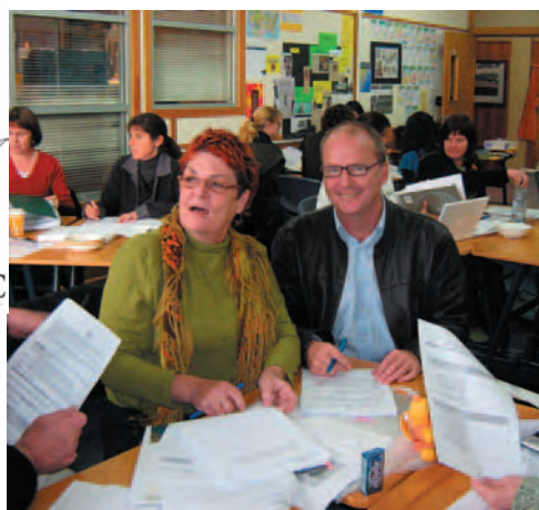
The curriculum support days took place amid PPTA's concern that the revised curriculum had been launched by the ministry without the provision of adequate professional development time for teachers to familiarise themselves with it.

The organisation of venues and facilitators in 24 regions of the country, and provision of resources for all teachers participating, proved to be a mammoth undertaking that severely strained PPTA's resources. However, despite the organisational challenges experienced, particularly during the first few weeks, members have indicated that they appreciated the opportunity to get to grips with the new curriculum. One unusual aspect of the activity was PPTA executive's decision to invite independent schools to participate in the exercise, which they did with great enthusiasm.