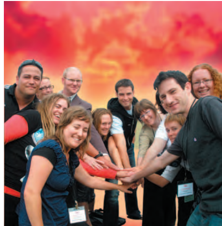
Young and new teachers network activists pose for the cover of PPTA's Beginning Teachers' Handbook .

Members are also active through a range of other committees. The young and new teachers (YANTs) committee encourages activism amongst beginning teachers. In the past year they have written a conference paper on the quality of support for beginning teachers and have developed a guide to assist new teachers. The senior positions taskforce is responsible for looking after the interests of deputy and assistant principals. The ICT taskforce is charged with monitoring the changes that ICT is bringing to secondary teachers and teaching. Other groups such as Komiti Pasifika and the regional women's co-ordinators meet to ensure that these groups have a voice in association decision-making. In December 2008 the PPTA executive authorised a one-off meeting of guidance counsellors to support them in their goal of establishing a professional association.