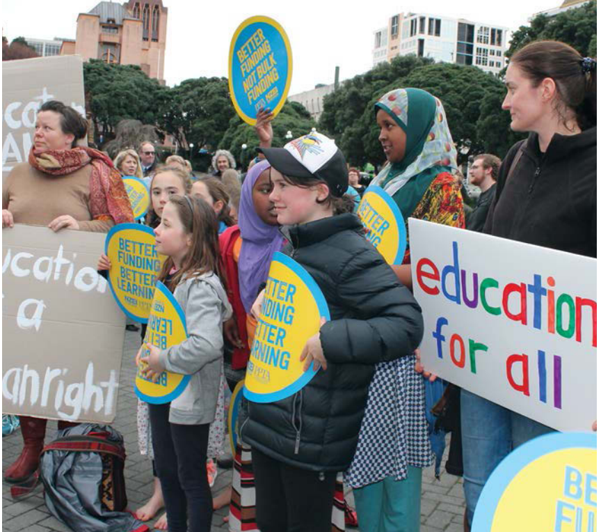
Education for all - families and supporters rally on parliament's steps to support quality inclusive education