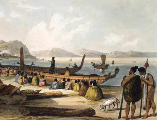
Learning Māori History - waka taua (war canoes) 1827-8