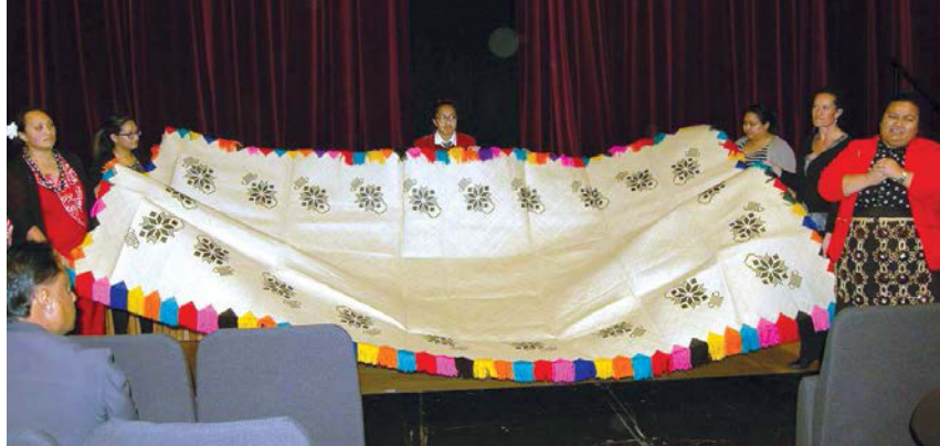
Big sisters: Inspired by the lalaga (weaving) theme of a PPTA Pasifika conference, Sacred Heart College old girls joined forces with the school community to support Pasifika students

empower them to be proud and confident Pacific women in society."