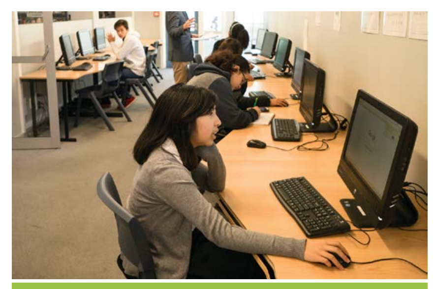
Technology in schools has obvious benefits but are our students equipped to use it effectively?

Most of our time spent on social media is certainly what could be classified as system 1, or fast brain thinking.