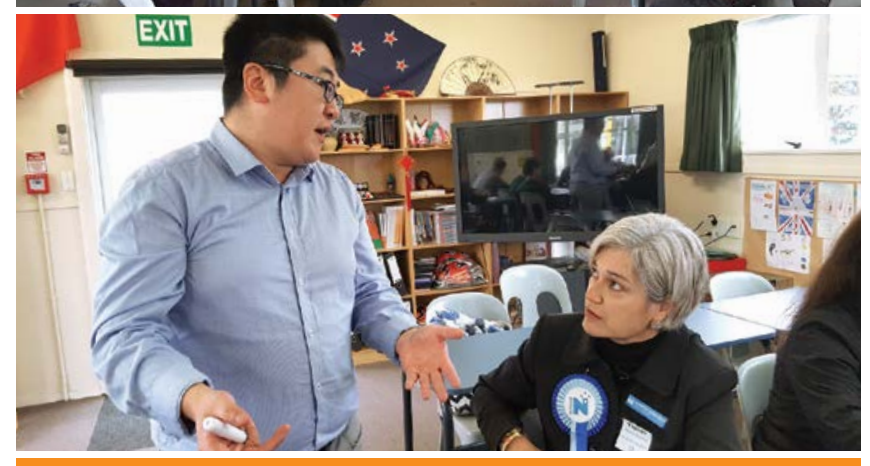
Schooling the politicians: Speakers at PPTA Manawatu-Whanganui political panel visited schools in the region beforehand

Before that particular panel the PPTA Manawatu-Whanganui region came up with a novel way of letting politicians experience what really goes on in the classroom. Political candidates sat in on secondary school classes in Ruapehu, Whanganui, Rangitikei, Manawatu and Horowhenua, interacting with teachers and students in an organic fashion.