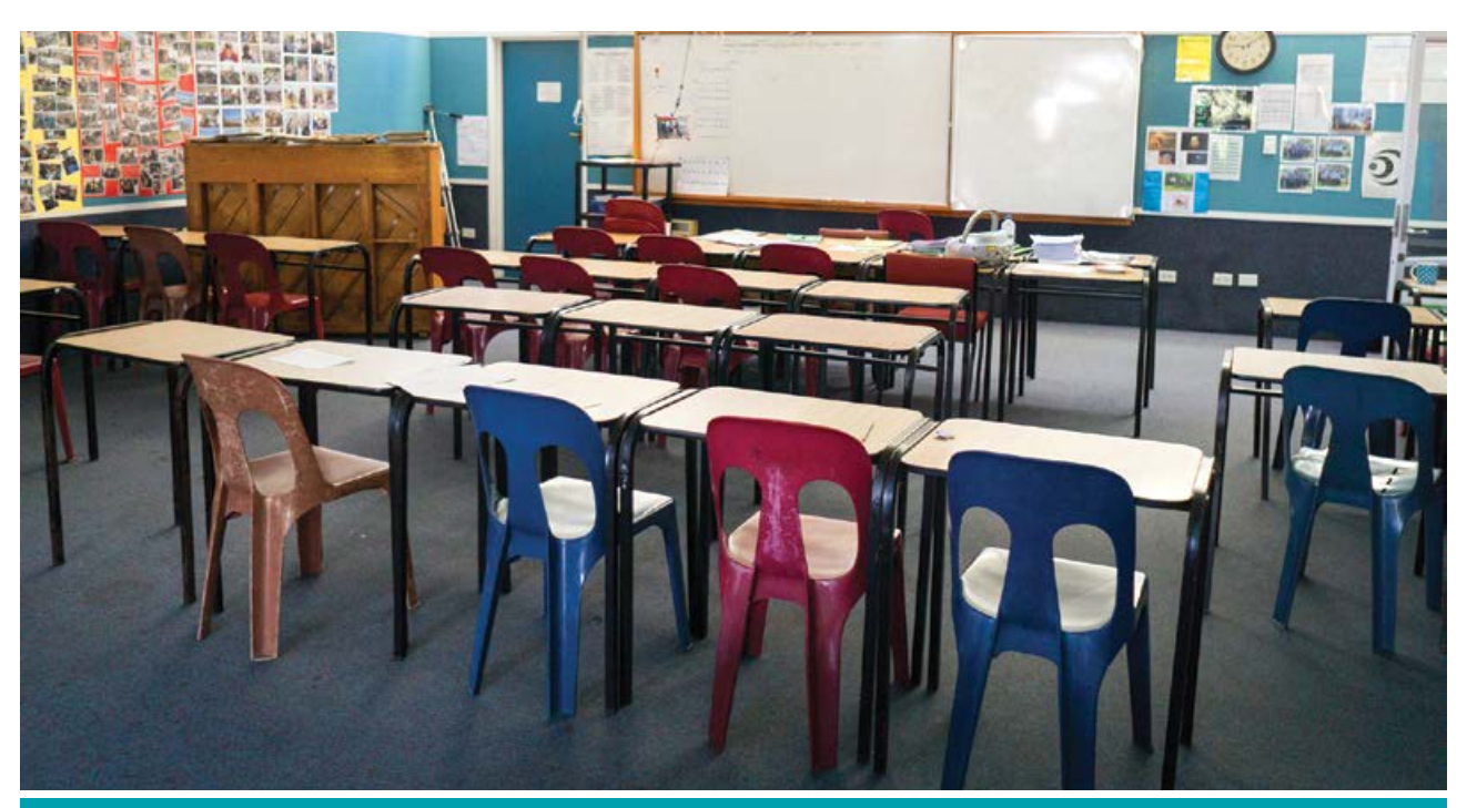
There are a number of options in your collective agreement if your school has a falling roll

The Advice and Issues section of the PPTA website explains the surplus staffing process in more detail. If you have any concerns or questions please contact your local field officer.