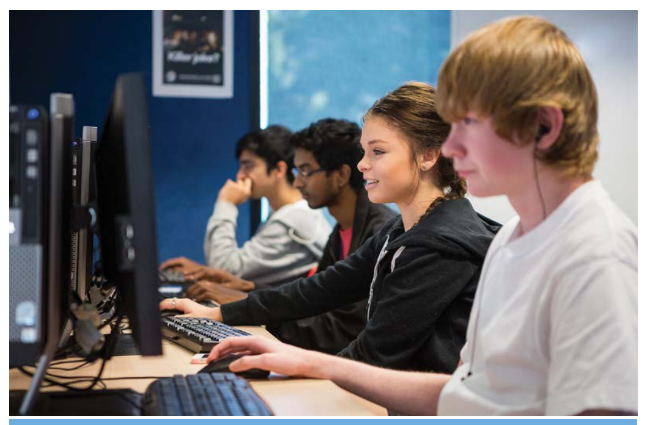
NZQA is working with schools to trial digital assessment

More information on can be found at nzqa.govt.nz under Digital Assessment: NCEA Digital Trials and Pilots.