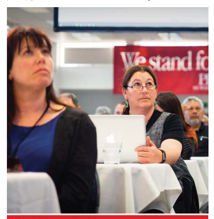
Finding solutions to secondary shortages: PPTA annual conference delegates have the hard discussions

Delegates present agreed, voting to accept the additional recommendation as part of a strategy they hoped would provide some serious answers to the teacher shortage.