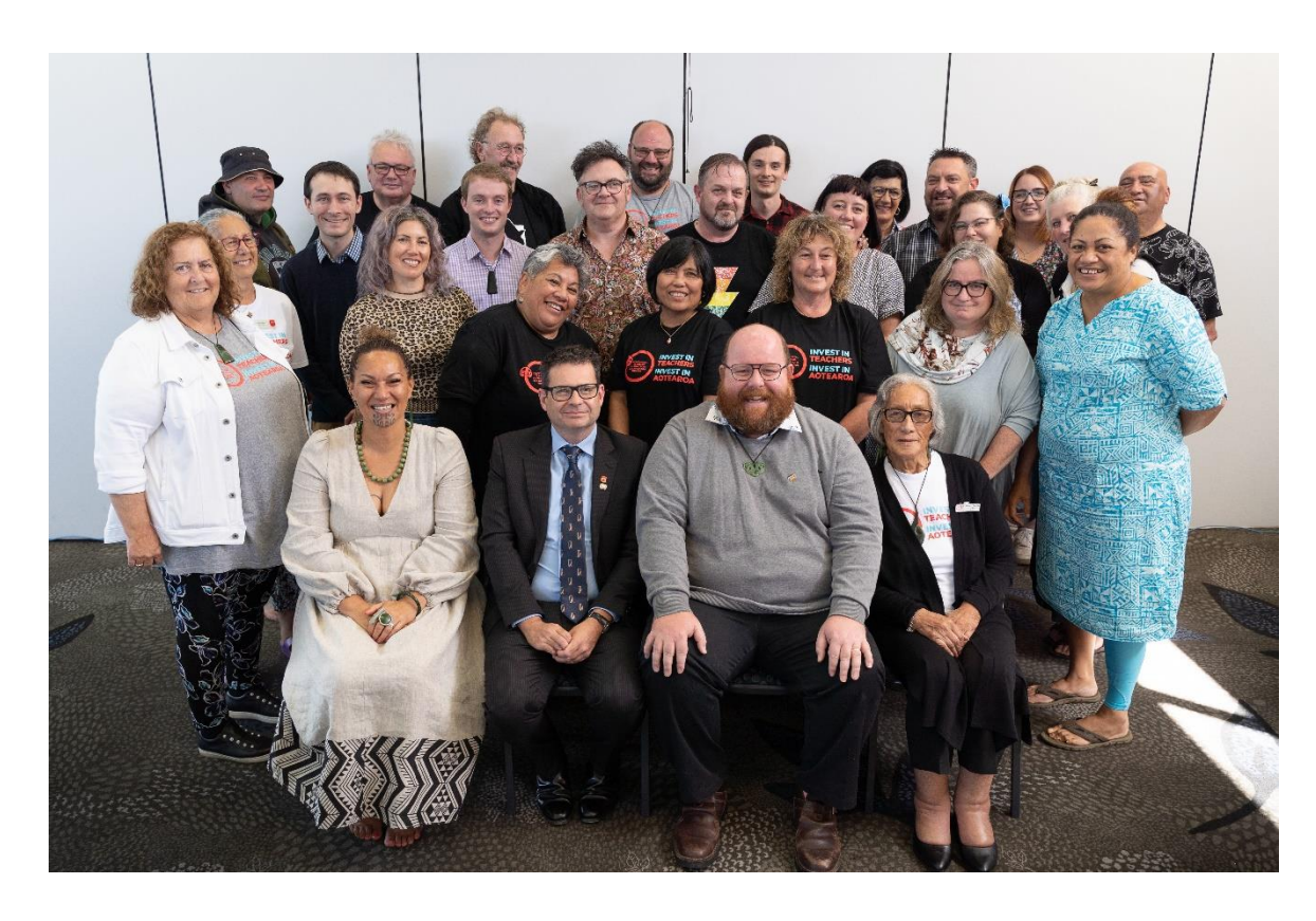
PPTA Te Wehengarua Executive 2023

An area of periodic tension that we are keen to pre-empt is in the process of future collective agreement negotiations. The independent Arbitration Panel (2023) provided guidance to PPTA Te Wehengarua, the Ministry of Education and the government on alternative approaches for negotiations. We believe that these approaches offer an opportunity for constructive and purposeful engagement and look forward to pursuing discussions on these proposals as a matter of priority.