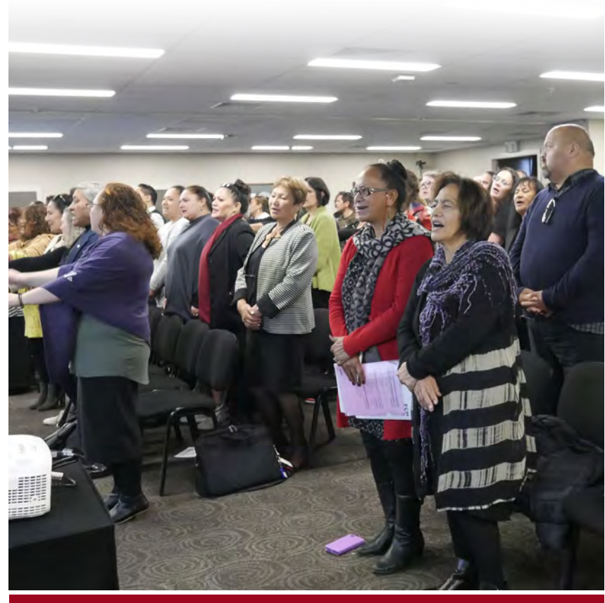
Attendees at the 2019 Māori Teachers' Conference