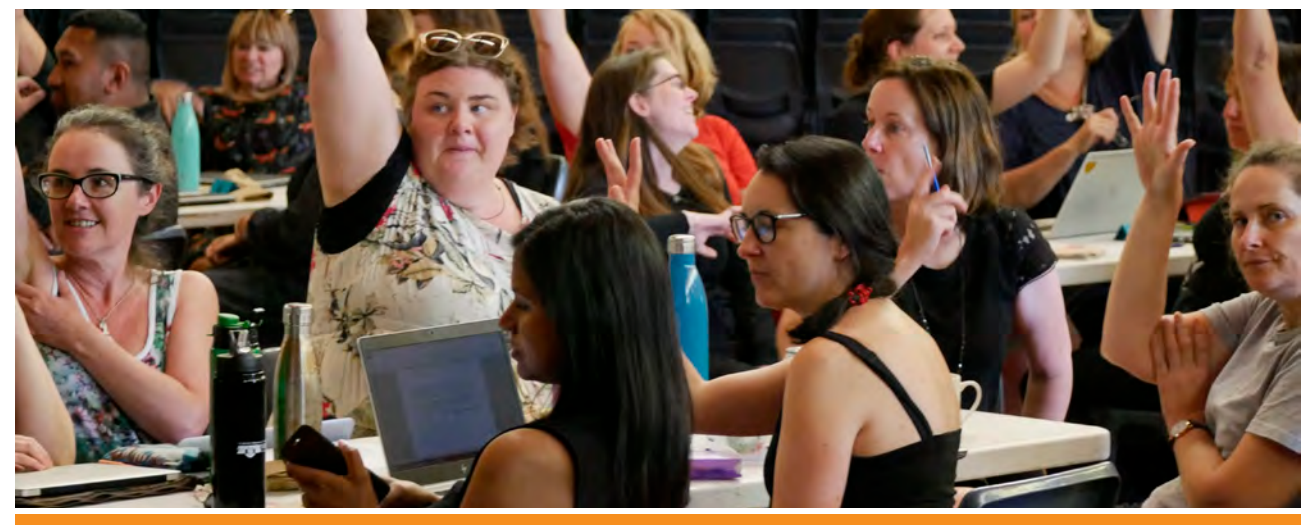
PPTA members have shown overwhelming opposition to the teaching council's plans

Keep an eye on ppta.org.nz for the latest updates.