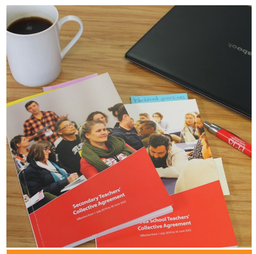
Making sure workload provisions in our collective agreements are clear, modern and legal.

The group identified a set of principles to guide changes to the agreements. Some existing provisions need to be clarified, some new provisions are