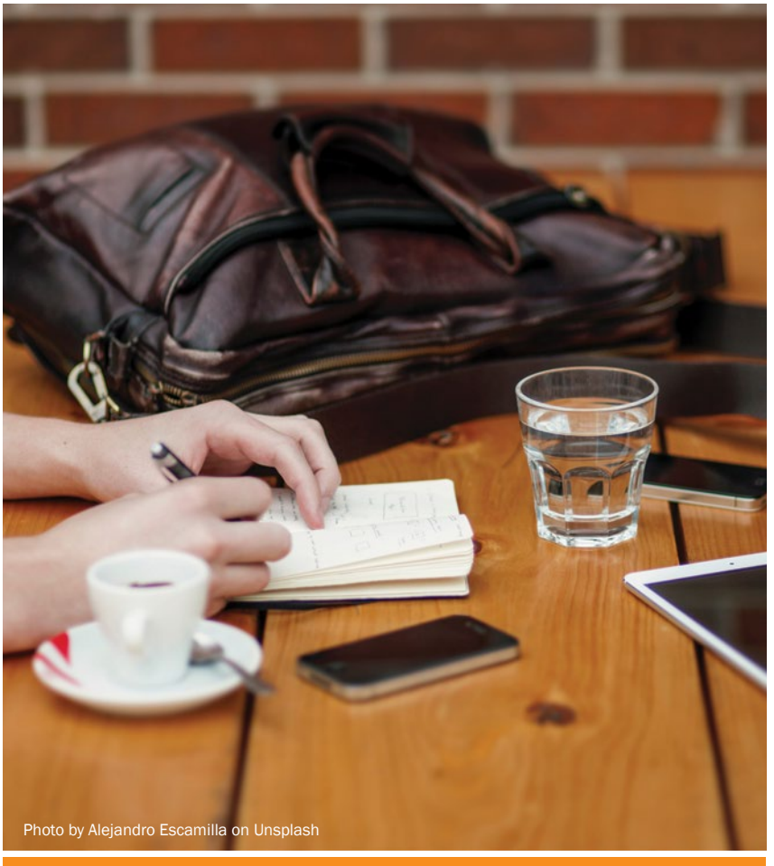
Talk with your field officer if you are unsure about fixed-term positions.