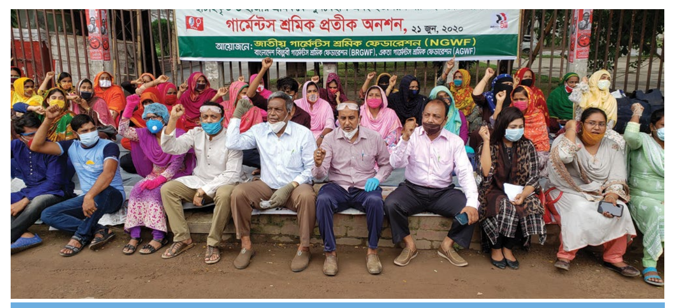
NGWF members stage a sit-in protest outside the Windy Group factory ground after being targeted for redundancy during Covid-19.

PPTA supports the work of UnionAid as a financial contributor for the work they do for our union comrades in Asia Pacific. To find out more about them visit unionaid.org.nz