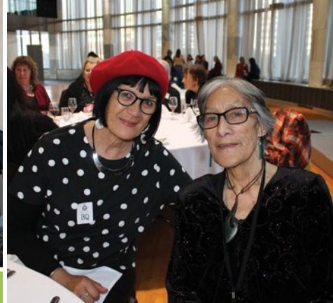
Breaking down barriers at PPTA's Women in Leadership Summit