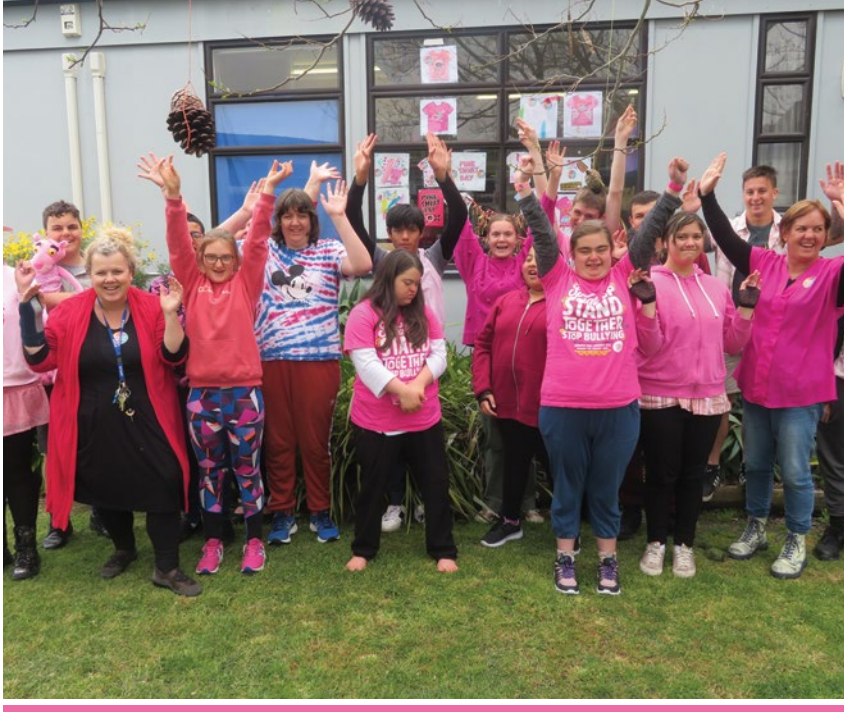
New Plymouth Girls' High School (above) and Havelock North High School stand together to stop bullying.