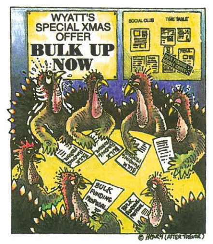
Don't let the Government treat you like a turkey!

000PS! I ACTUALLY MEANT DIVIDE UP AMONG THE STAFF