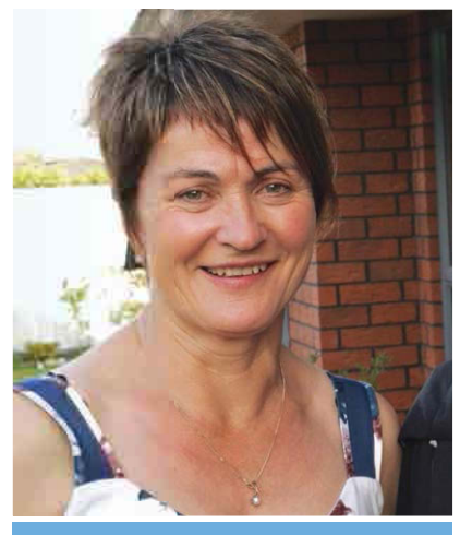
by Karen Corbin

A successful classroom environment relies on everyone working together cooperatively and collaboratively. This environment is established and sustained by face to face activities where body language can be read and the conversation is not limited by the technological aptitude or keyboarding speed of participants.