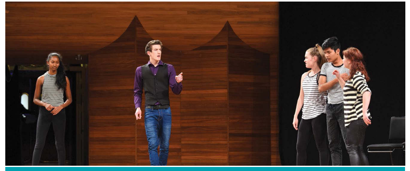
Buller High School students take to the stage at the SGCNZ Shakespeare Festival nationals

She confirmed the difficulties in finding sufficient funds each year in an increasingly stretched market-place. Major additional amounts were required to hire the larger venues now essential because of the number of people wishing to be involved, and "seismic issues" had severely reduced the number of options available, she said.