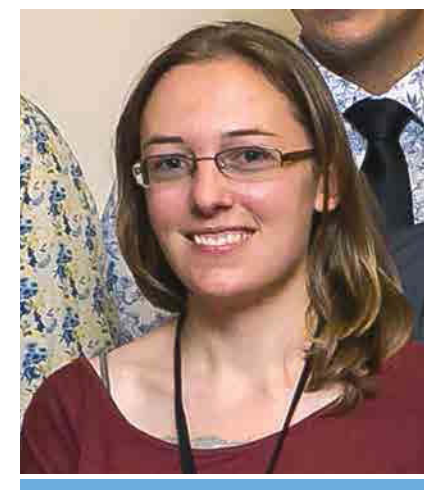
by Katie Scott

The way I see it, there are two approaches to having devices such as cellphones and tablets available to students during class time. We can embrace them, and encourage students to use them. Or we can ask that they remain in bags. NB: these are not mutually exclusive.