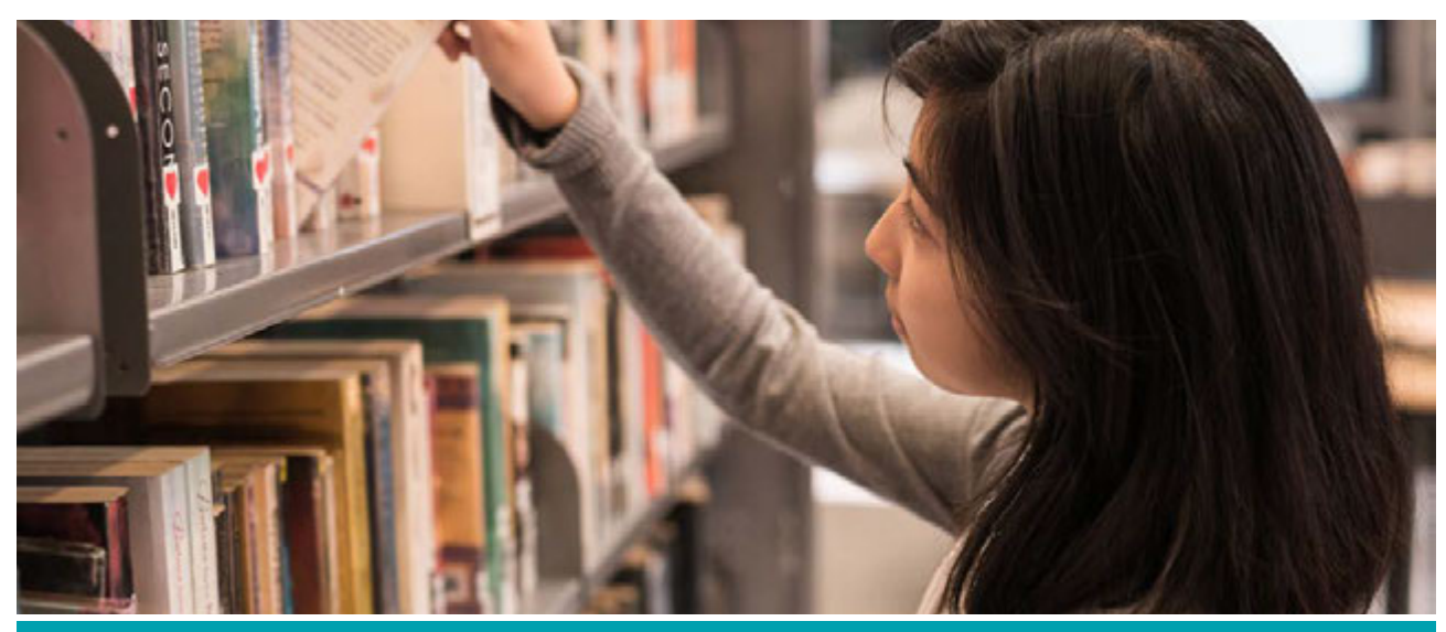
"It is our job to think hard about what students need to know as well as what they need to be able to do."

You can read an extended version of this piece on Taylor's blog, The Native Hue of Resolution - thoughts on NZ education.