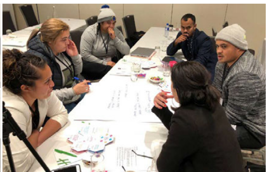
A Pasifika perspective: Attendees at PPTA's Pasifika Conference discuss the NCEA review.