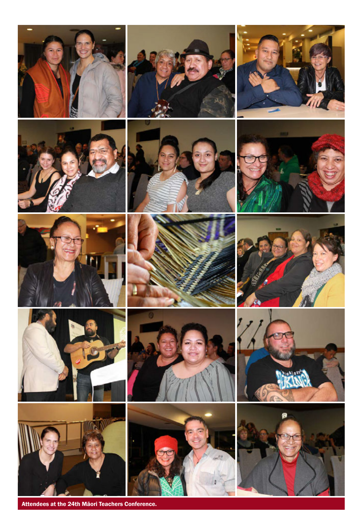
PPTA NEWS August | Hereturikōkā 2018 | 11