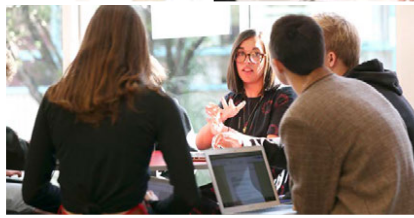
"The essence of education is caring teachers working alongside students as mentors and influencers."

to the school) this vital area of the curriculum, though we remain unable to satisfy demand.