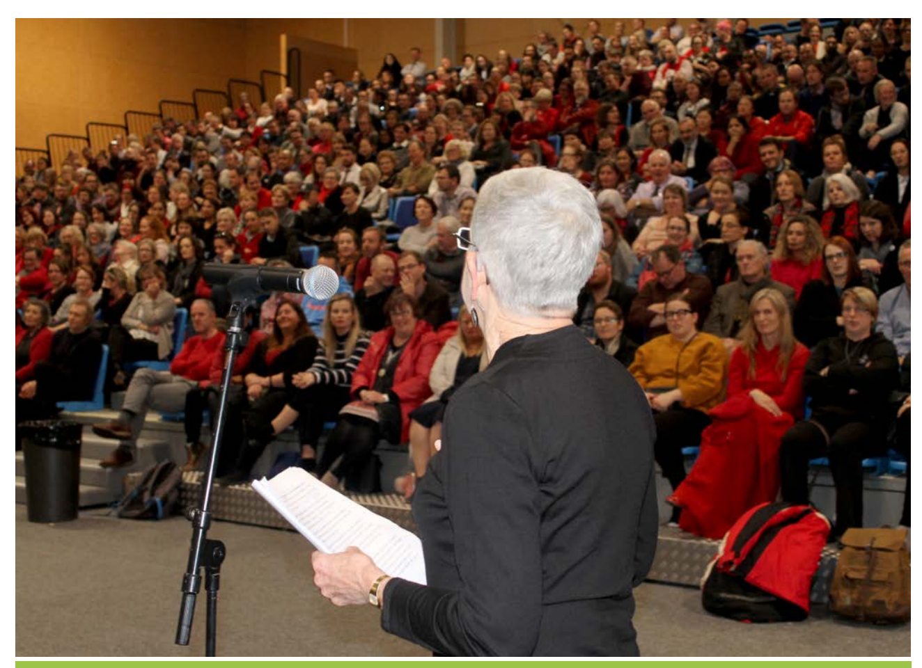
Stronger together - after regional paid union meetings branches were asked to meet to discuss additional claims.

Members can refer to the PPTA website for further information.