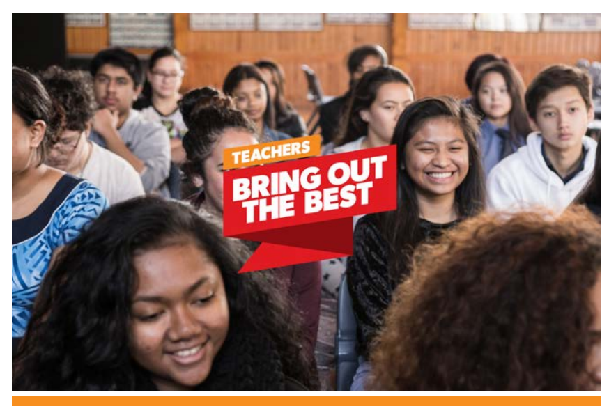
Teachers want to bring out the best in their students and the community is behind them.

The government will have to listen – because only then will we be able to recruit and retain the teachers our children deserve.