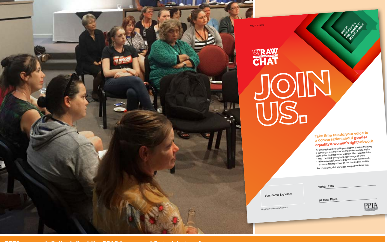
\ensuremath{\mathsf{PPTA}} women talk the talk at the 2019 Issues and Organising conference.