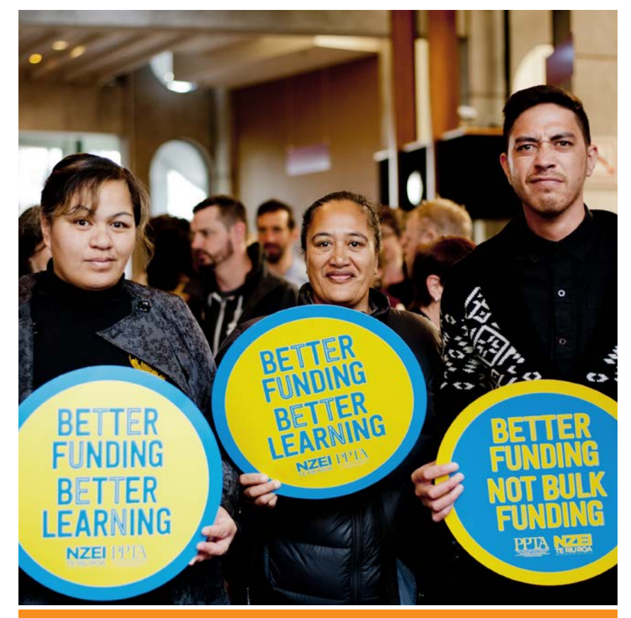
Drawing on teacher expertise to fend off bulk funding.

When we work together right from the start, the chance of us heading down the wrong path becomes much less likely.