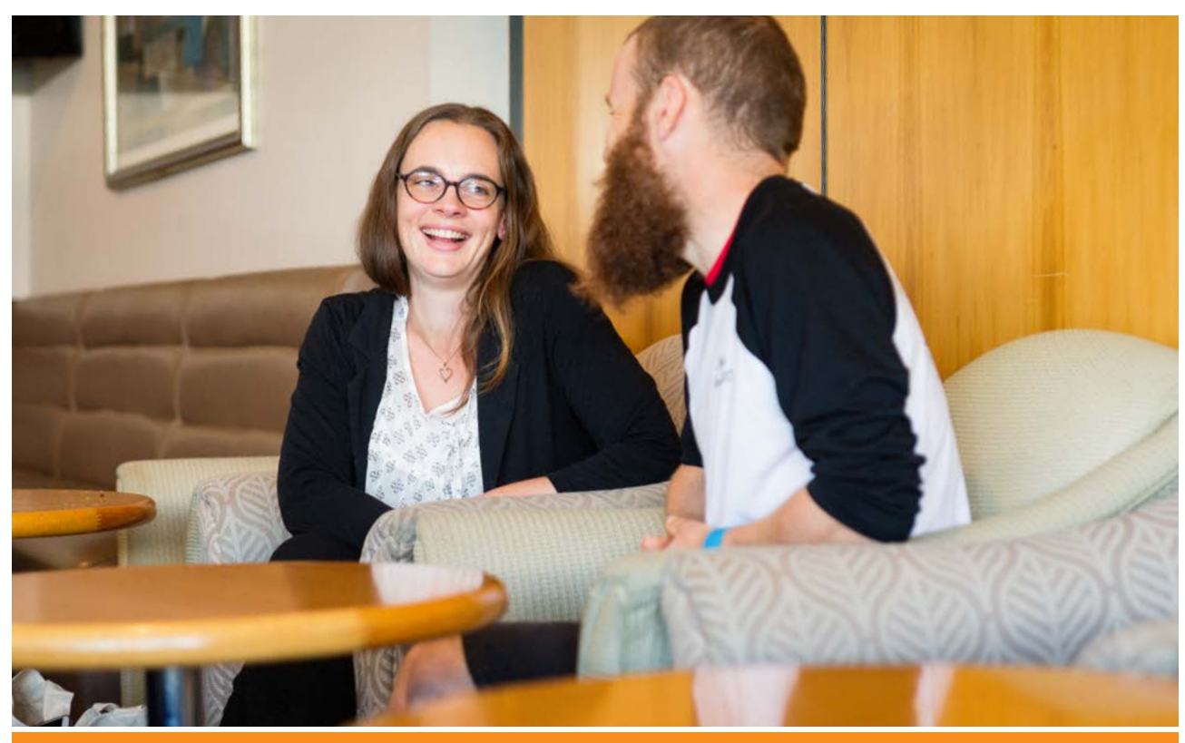
Paid time for delegates to undertake union activities, including individual member representation is now enshrined in law.

For more detailed information on who is considered a delegate, what duties are covered, how much time is appropriate, how time might be provided, delegate obligations and establishing the paid union delegate time process in your school, visit ppta.org.nz or email enquiries@ppta.org.nz